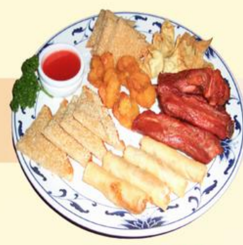
Oriental Mixed Platter (4 Portions)