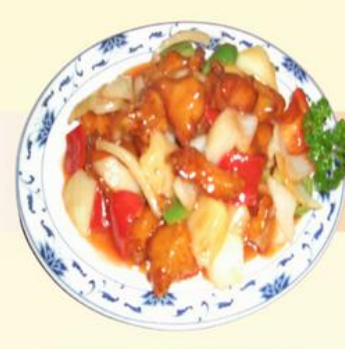
Sweet & Sour Chicken