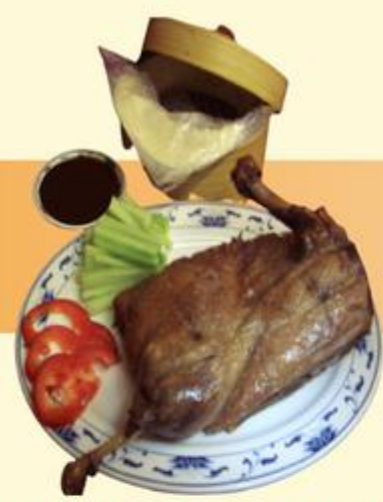
Half Crispy Aromatic Duck