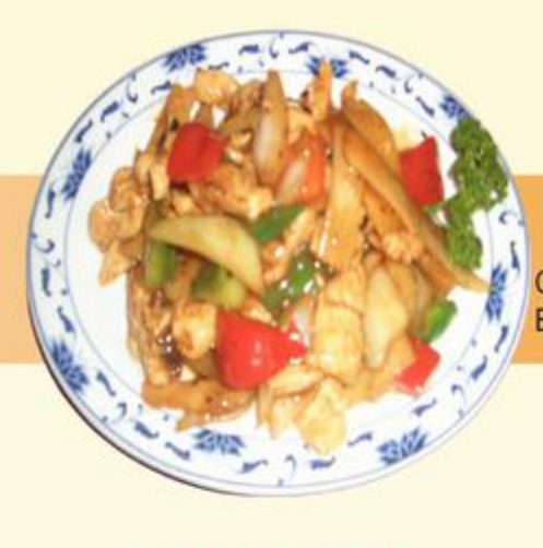
Chicken in Blackbean Sauce